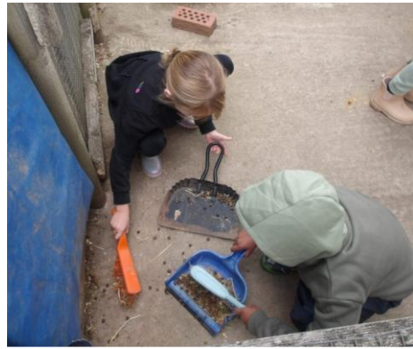
Cleaning the rabbit pens