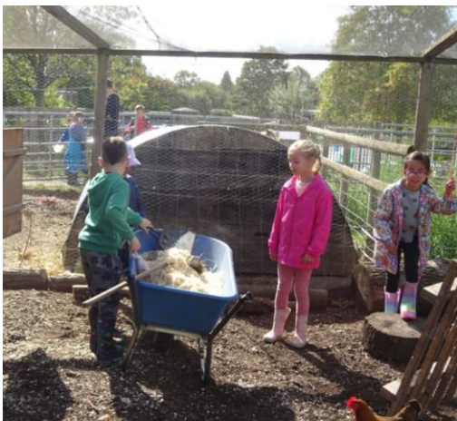
Cleaning the chicken pens