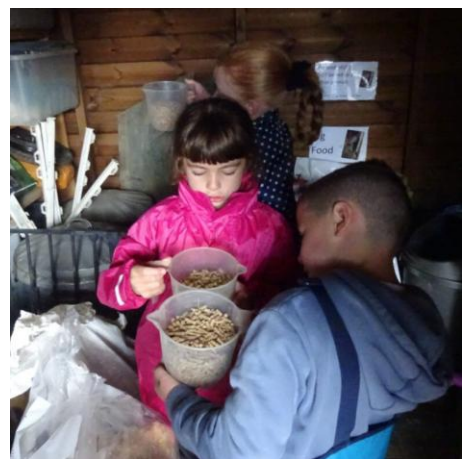
Measuring out the food