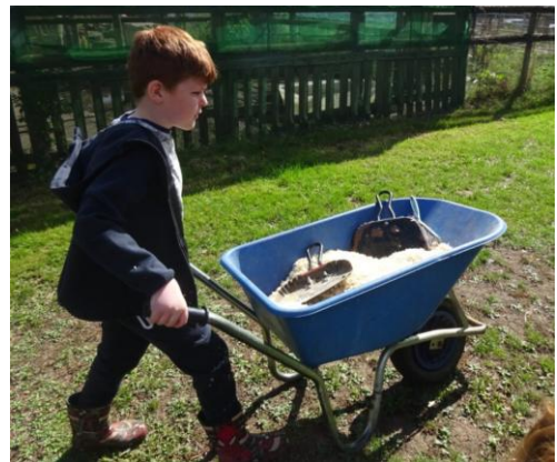
Collecting the equipment