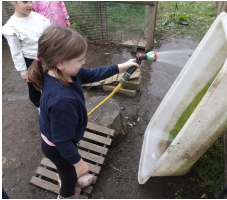
Washing the duck bath