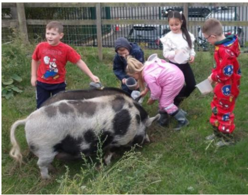
Brushing the pigs!