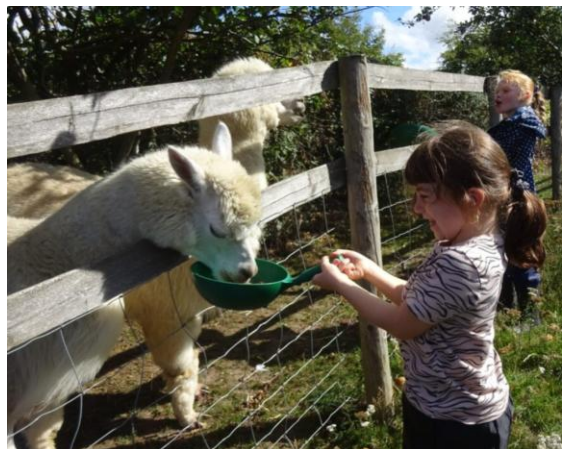
Feeding the Alpacas